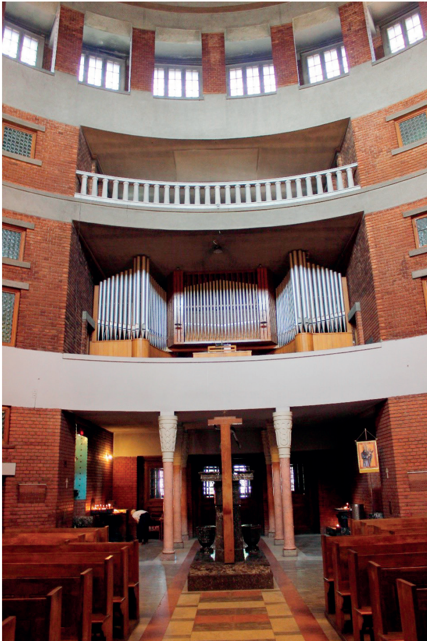
Figure 9. The Parish Church of Saint Anthony of Padua: the interior view of the entrance with the organ on 2 nd level (2013)