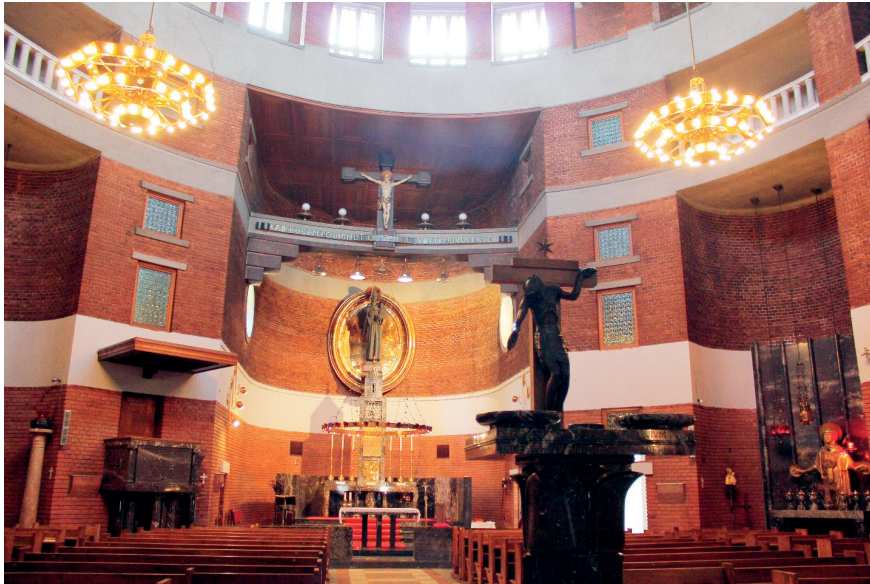
Figure 6. The Parish Church of Saint Anthony of Padua: an interior view of the main apse (2013)

are the same, but the interior along with its furnishing is far more de-segregated and is all about making special ambient and scenarios. The interior furnishing started in 1934, according to Plečnik's designs.