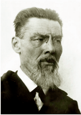
Figure 1. Jože Plečnik (1872-1957); a photograph taken in 1930 5

Plečnik stayed in Prague until 1921, when he moved to his hometown Ljubljana, in order to teach again at the newly founded Department of Architecture at the Technical Faculty of the University of Ljubljana. Besides many other notable masterpieces, some of his best projects were designed for his hometown: the Slovene National and University Library (1930-1941), Tromostovje -bridges over the Ljubljanica River (1929-1931) in the very centre of Ljubljana, the Ljubljana Open Market (1939-1942), and many others. Due to his strong connection with the church and ecclesial orders, his engagement at the university was heavily reduced during the communist regime.