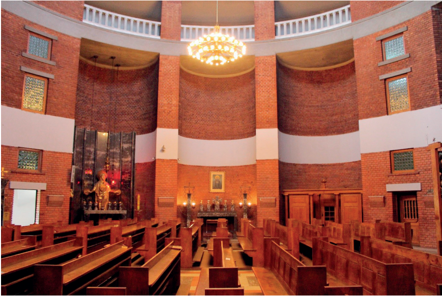
Figure 7. The Parish Church of Saint Anthony of Padua: an interior view of the southern apses (2013)

Two other altars were done according to Plečnik's ideas: the first altar on the right side of the main apse is devoted to Mary's Annunciation and the other to the Most Sacred Heart of Jesus, the first to come on the left side of the main apse. The statues for both altars were done by Božidar-Bože Pengov, a noticeable Slovenian sculptor. The Most Sacred Heart of Jesus was built at the end of 1935, while Mary's Annunciation was built in August of 1938, with the statue of Our Lady installed in 1939. 30