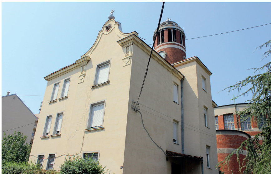
Figure 3. The Convent of Saint Anthony of Padua: a view of the entrance from the northeast, from Bregalnička Street (2013)

Blaž Misita-Katušić, the architect, heavily engaged in the restoration and reconstruction of building heritage all over Yugoslavia, did a design appropriated to his current work. The convent is a semi-detached house, with the entrance from Bregalnička Street, located in the very