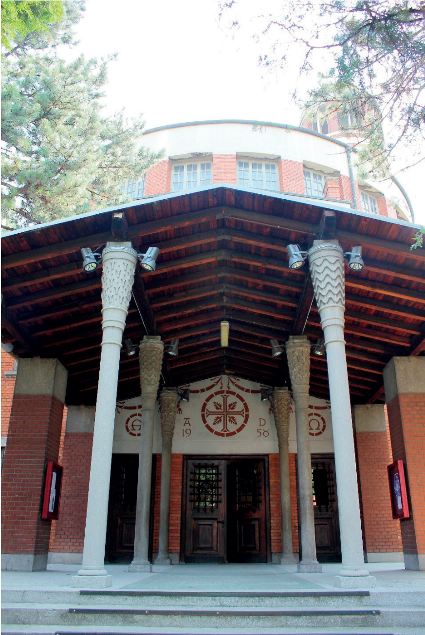
Figure 8. The Parish Church of Saint Anthony of Padua: the entrance portico (2013)