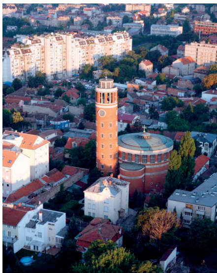
Figure 2. The Convent and the Parish Church of Saint Anthony of Padua: air view from the east; the photograph taken before 2011 14

convent and the church were approved. 15 The construction of the new convent in Belgrade was assigned to Blaž Misita-Katušić, the architect. 16