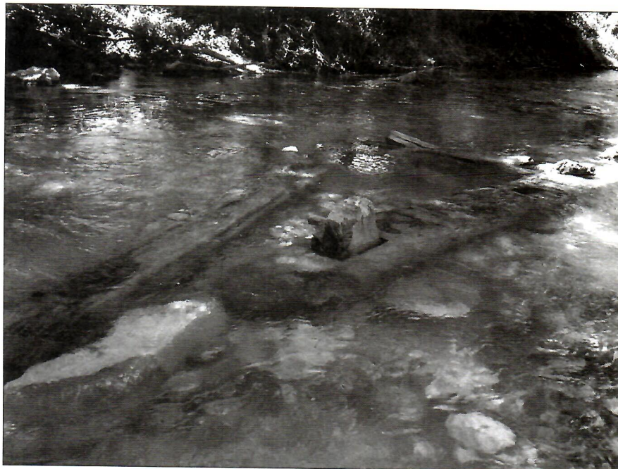
Sl. 1 i 2. Ostaci drvenog mosta u Konjicu.