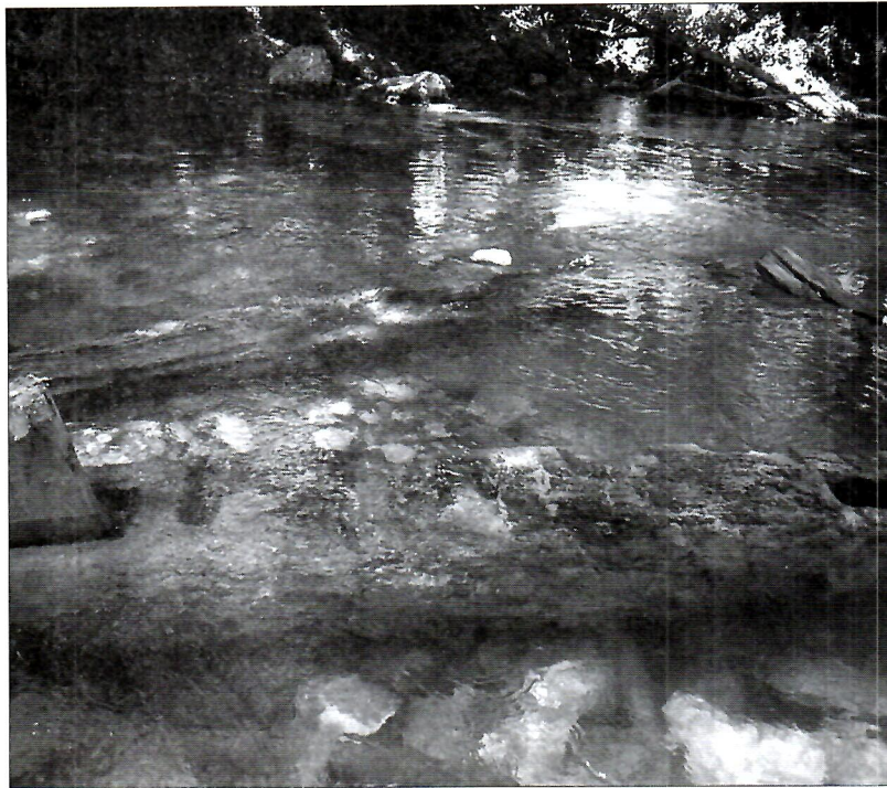
Sl. 3 i 4. Ostaci drvenog mosta u Konjicu.